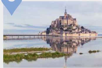
Le Mont Saint Michel, Normandie