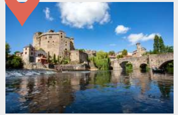
Clisson, Loire Atlantique